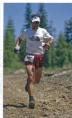
LEFT TO RIGHT: Incarnations of Karnaze: Endurance 50, Badwater 135, South Pole Marathon and Western States 100-Mile Endurance Run.