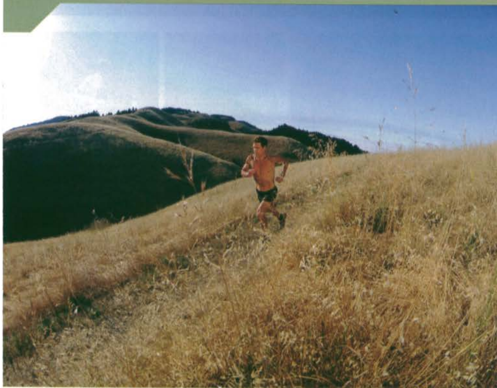
Karnazes on one of his backyard favorites, Mount Tamalpais, San Francisco.

nonprofit foundation to support programs for youth health and fitness.