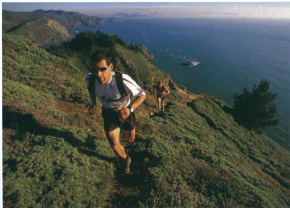
CLOCKWISE FROM ABOVE: Karnazes running oceanside, Marin County, California; his two recent book releases; with First Lady Michelle Obama during Run Across America; hamming it up with his employees at U-Top It.